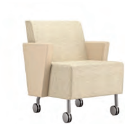
> LOUNGE #4295 > ARMS > CASTERS