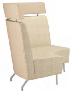
> INTIMA MODULAR #4240 > QUARTER-ROUND UNIT > HEADREST