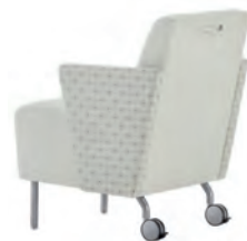
> LOUNGE #4295-CR-P > ARMS > FIXED LEGS FRONT > CASTERS REAR > PULL HANDLE