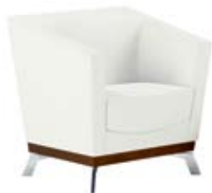
> LOUNGE #2701 > POLISHED ALUMINUM LEGS