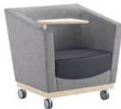
> LOUNGE #2721-TA > ROTATING TABLET > CASTERS