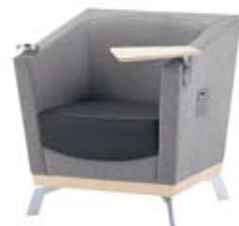
> LOUNGE #2701-FT-CH-4103 > FLIP-UP TABLET > CUP HOLDER > POWER TRAY