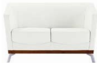
> LOVE SEAT #2702 > POLISHED ALUMINUM LEGS