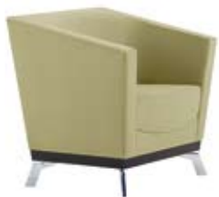
> LOUNGE #2701 > POLISHED ALUMINUM LEGS

Savvy design and superior comfort set the stage for Achella, an expressive lounge collection featuring straight and tapered lines beautifully counterbalanced with fluid contours. Combining metal, wood and upholstered elements, Achella lounge, love seat and sofa models deliver stellar form and aesthetic brilliance — not to mention a variety of options to realize a purpose beyond simply waiting.